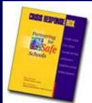
Crisis Response Box

“We found that organizing a box . . . that contains crucial information we would need to respond to a critical incident was a great way for both the schools and the police to think through how they would work together in an actual crisis. The principal, local police and local fire department have the same kit. Every summer we meet and review the contents and update them.”